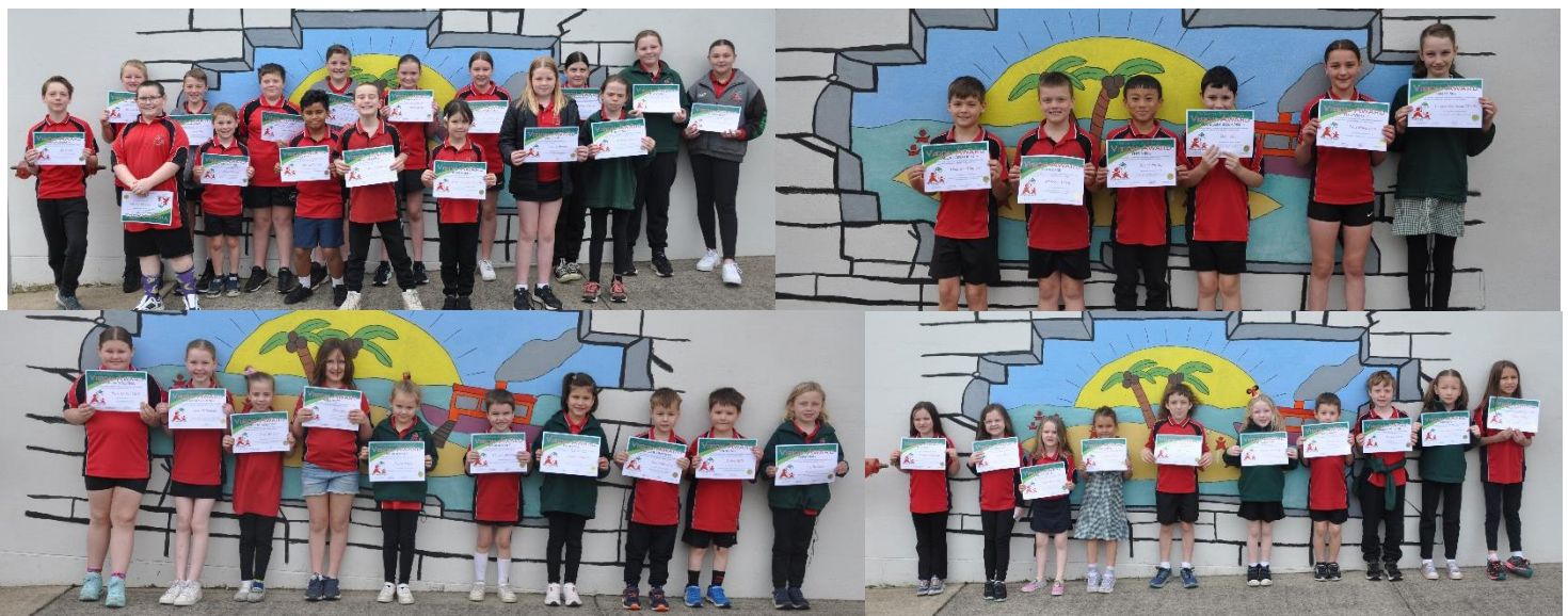
Term 3 Week 6 Winners pictured also.